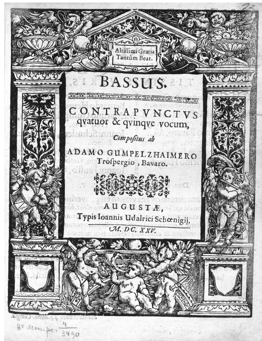
Plate 1. Bayerische Staatsbibliothek München, Mus.pr. 3490, Beiband 4, Adam Gumpelzhaimer, Contrapunctus quatuor & quinque vocum ... (Augsburg: Johann Ulrich Schönigk, 1625; RISM series A/I, G 5138; RISM Online Catalogue; not cited in VD17), Bassus partbook, title page; reproduced with kind permission.

Gumpelzhaimer's hand symbols and their index fingers designate the paired sets of staves in his score and the custos mark at the end of each staff in these paired stave sets corresponds to the musical note printed at both the beginning and end of its adjacent staff. The paired stave set on the first and second staves in Gumpelzhaimer's score in Example 2 will illustrate these points. The first staff of this set ends with a custos mark on e^2 and its subsequent hand symbol directs singers to the second staff where both its first and last notes match the pitch of the aforementioned custos mark. Likewise, the second staff of this set ends with a custos mark on g^2 and its subsequent hand symbol instructs singers to move to the first staff where its first and last notes correspond to the pitch of the relevant custos mark. Theoretically the custos marks permit two possible interpretations, though only one reflects Gumpelzhaimer's intentions.