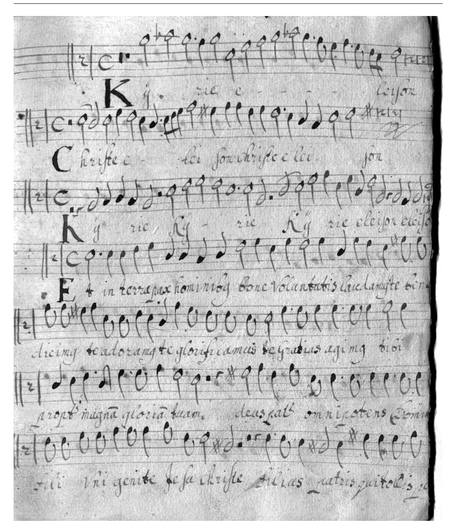
Plate 6: A.N. 49: Johann Stadlmayr, Missae breves à IV. Cum una pro defunctis, et alia V. voc. concertatae ... Editio secunda ... ( Innsbruck, 1660; RISM A/I, S 4299 ), manuscript Altus partbook, fol. [1]<sup>r</sup>, beginning of the '[Missa I. De Dominicis (a 4)]', copied by a contemporary hand, reproduced by kind permission of the Bischöfliche Zentralbibliothek Regensburg.