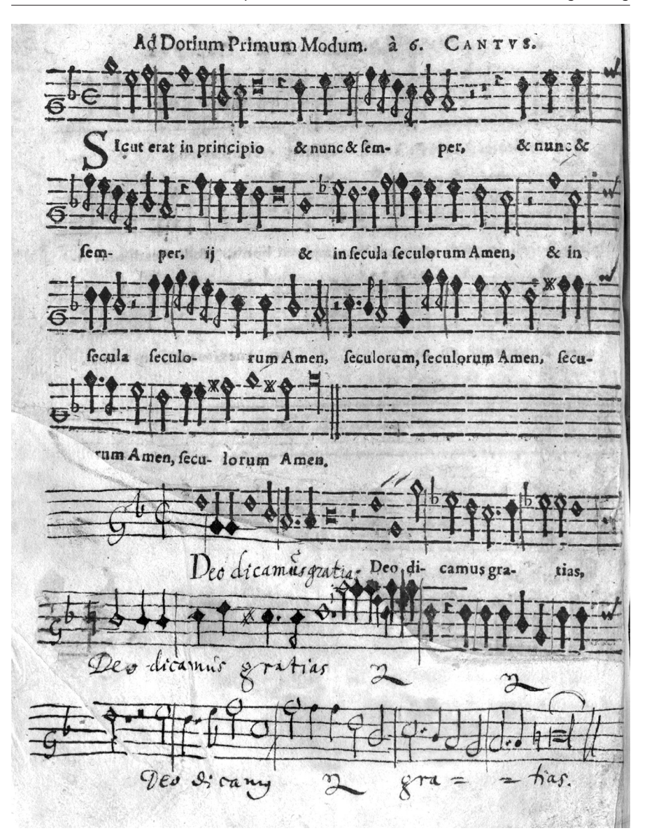
Plate 2: A.N. 14: Christoph Demantius, Trias precum vespertinarum ... (Nuremberg, [1602]; RISM A/I, D 1533), Cantus, signature h1<sup>v</sup>, Magnificat et Benedicamus Ad Dorium Primum Modum: Super 'L'aura dolce' (a 6), 'Sicut erat in principio' and 'Deo dicamus gratias' sections, the last includes manuscript material copied in the late seventeenth century, reproduced by kind permission of the Bischöfliche Zentralbibliothek Regensburg.